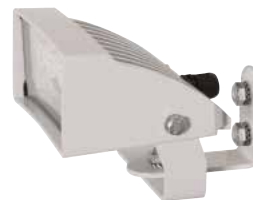
GEKO IRH WHITE LIGHT