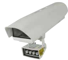
HOV + OSUPPIR + GEKO IRH